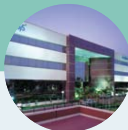
Infosys Corporate Office Bangalore, India