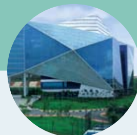
Infosys Campus Mysore, India