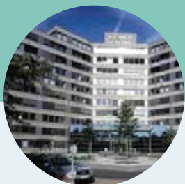
Acunova Europe Research Center, Frankfurt

Choose Infosys Acunova for a high quality reliable partner to bring new drugs faster to market, cost-effectively