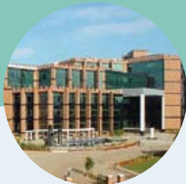
Safety Lab for Drug Testing, Manipal University Campus Manipal, India