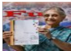
Delhi CM Sheila Dikshit releases a brochure