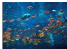
Fish inside the Giant Aquarium of the Dubai Mall