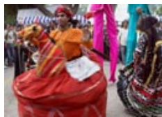
Folk dancers perform during the Delhi YMCA Carnival 2009